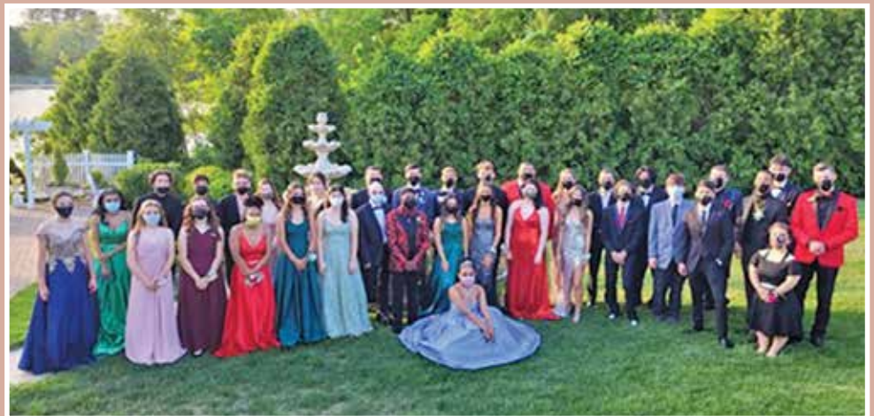
Class of 2021 Prom: The Class of 2021 celebrated their senior year with their prom at Merlot on the Water on May 21st.