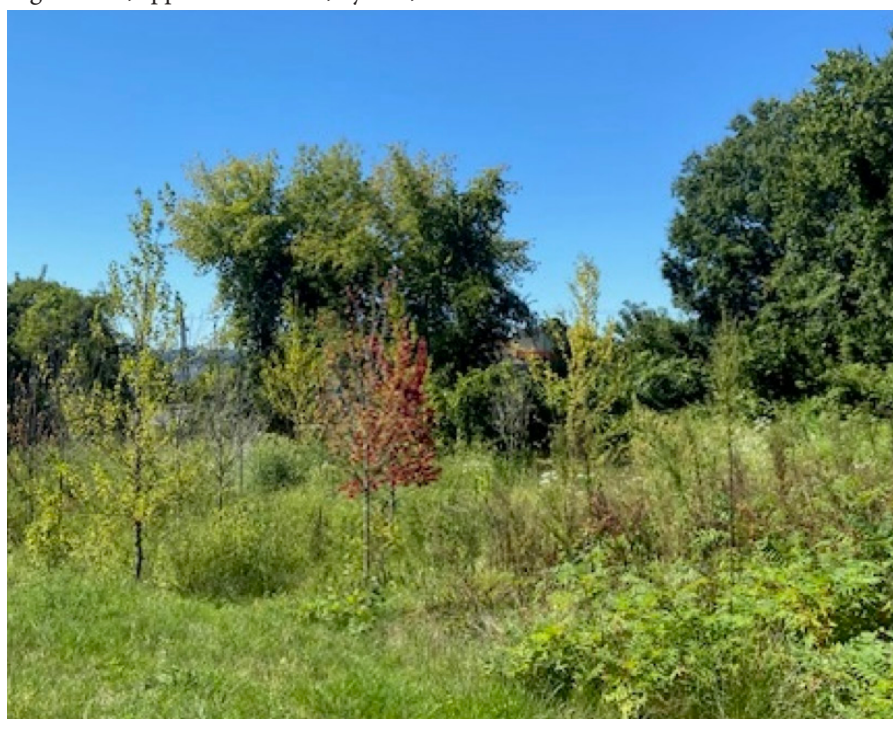
3 Thompson Road - Wetland Restoration