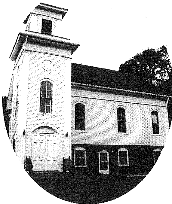
Windsorville "Church Among the Trees" 1876