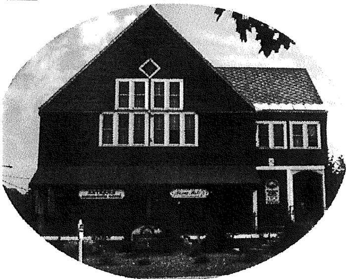
Broad Brook Opera House 1892