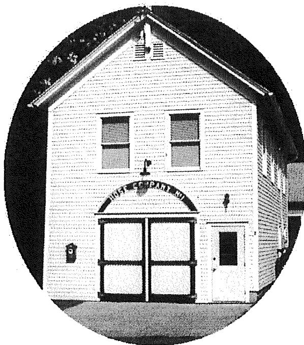
Warehouse Point Hose House 1911